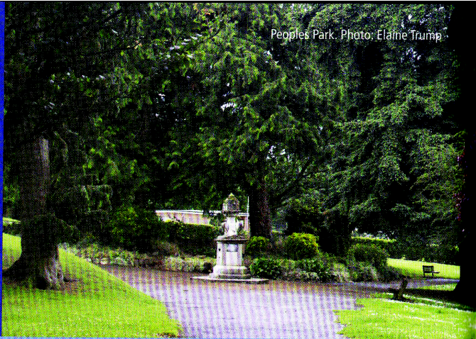
Peoples Park.

Tiverton Parkway Railway Station is only seven miles away and there is a Bus Station close to the town centre.